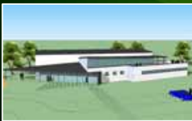
Artist's Impressions of what the new redeveloped Oxfield Centre might look like.