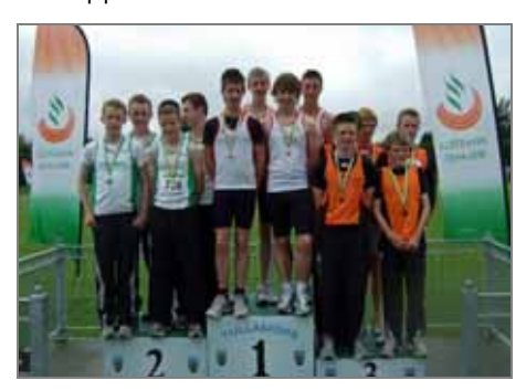
The North Sligo AC U15 Boys team on the podium after taking gold in the 4x100m competition.

The North Sligo Athletics Club had a very successful end of season at the Woodies DIY Juvenile athletics championships in Tullamore recently. There were many individual and team Gold, Silver and Bronze medals won by Sligo athletes and also many more athletes performing very well for top 8 finishes. Congrats to all athletes for all their effort, and to the coaches, parents and supporters who made it all happen.