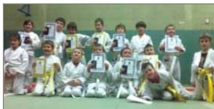
Little Ninjas from the North Sligo Higashi Karate Club at Oxfield following their recent grading exam.

Congrats to the 25 karate students who attended their recent grading exam. A big thanks to all parents who came along to support their little Ninjas on this big occasion. Everyone put in a great effort with all passing the skill tests with flying colours. The Instructors at the North Sligo Higashi Karate Club are very proud of you all. Training continues on Fridays in Oxfield. New starters welcome to try it out.