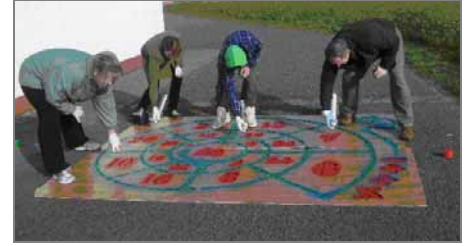
Staff & volunteer parents applying the markings.