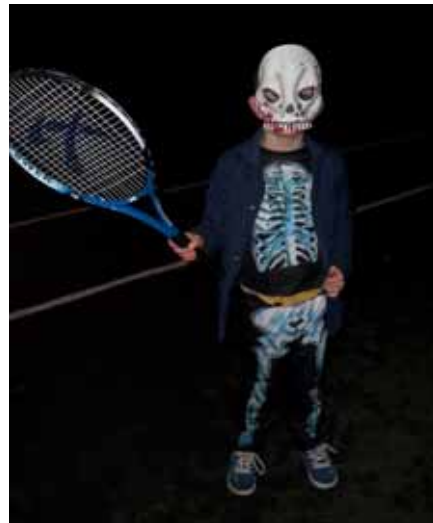
Frightening tennis - one of the young players from Oxfield at the recent Allwin junior Halloween festival.

Tennis continues on Fridays in Oxfield from 4-5pm for U8s and 5-6pm for 9-12s. The adult cardio tennis is over now until spring. For info contact Olwyn 086 3514123.