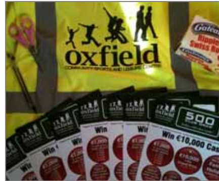
Oxfield 500 Club Ticket Sellers Survival Kit?

A huge thanks goes to our team of volunteer ticket sellers who are giving up their evenings to go door to door to sell 500 Club tickets. It's not an easy task, but they are doing it with a quiet determination and a smile on their faces, and all for a worthy cause which will ultimately benefit the entire community. Again thank you, thank you, thank you!