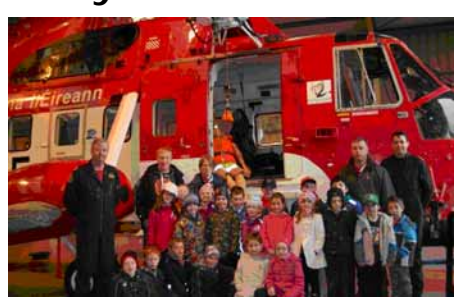
The 11th Sligo Benbulben Beaver Scouts who earned their Air Activities badge when they visited Sligo Airport recently