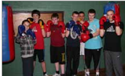
Some of the members of the local Boxing Club.

The local Maugerow amateur boxing club is going from strength to strength, with a growing membership of all ages and abilities. Coaching continues in Oxfield on Thursday evenings from 7:30pm. New members always welcome.