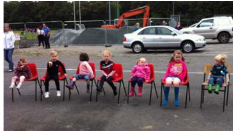
The early visitors (aka rice crispy bun tasters) to the Oxfield Hospice coffee morning

A big thanks to everyone who supported and helped to run all the local coffee mornings in aid of the North West Hospice earlier this month.