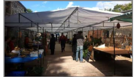
Ready for All Weathers - The Saturday morning craft & farmers market at the Benbulbin Centre in Rathcormac now has a roof...what rain?